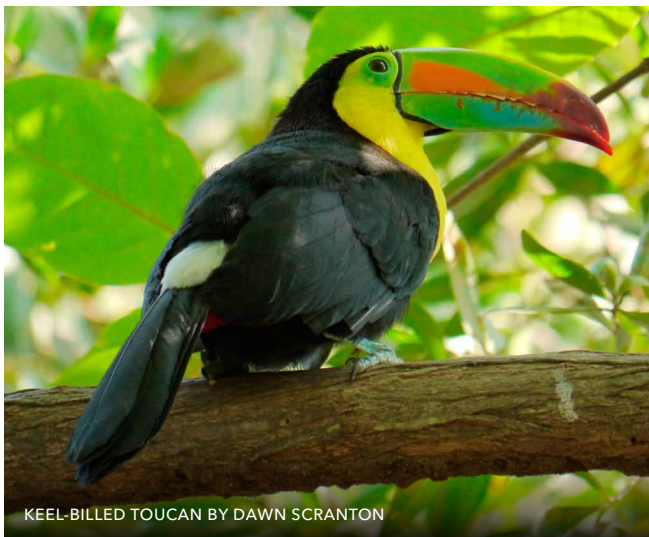
KEEL-BILLED TOUCAN BY DAWN SCRANTON