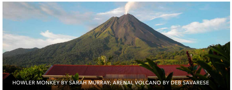
HOWLER MONKEY ; ARENAL VOLCANO