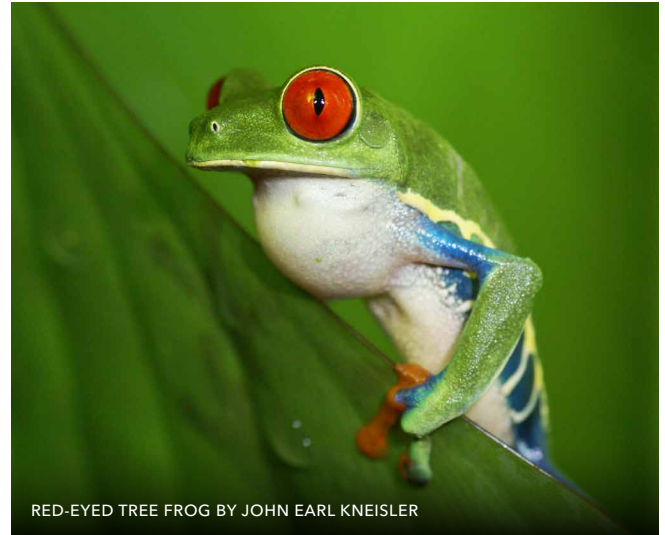
RED-EYED TREE FROG BY JOHN EARL KNEISLER